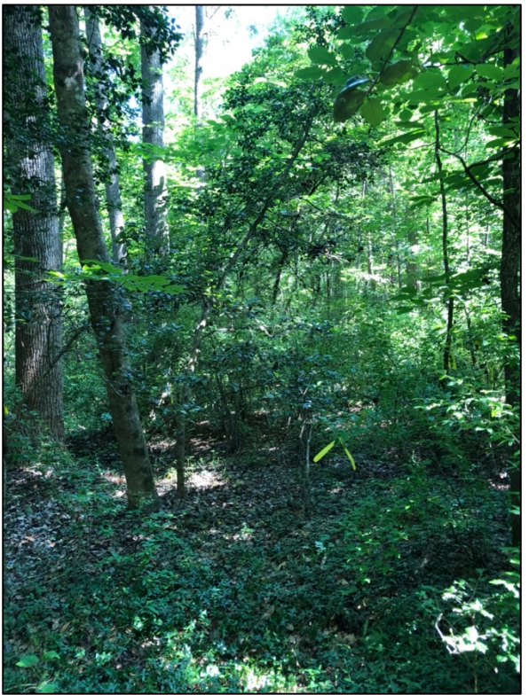
a. Photo of Oak Tree in Cemetery