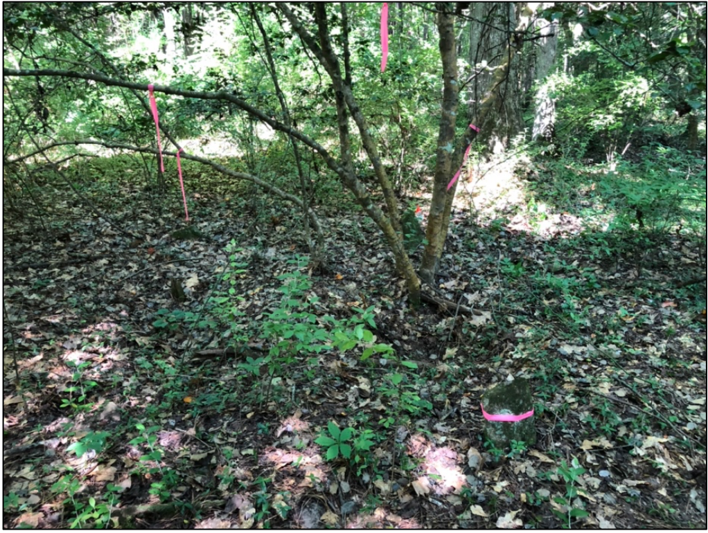
Figure 3. Selected Photographs of Graves.