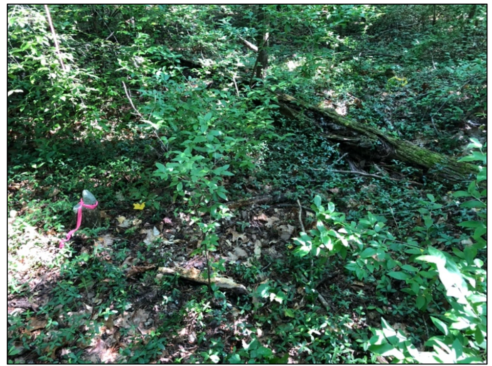
b. Photo of Vinca in Cemetery