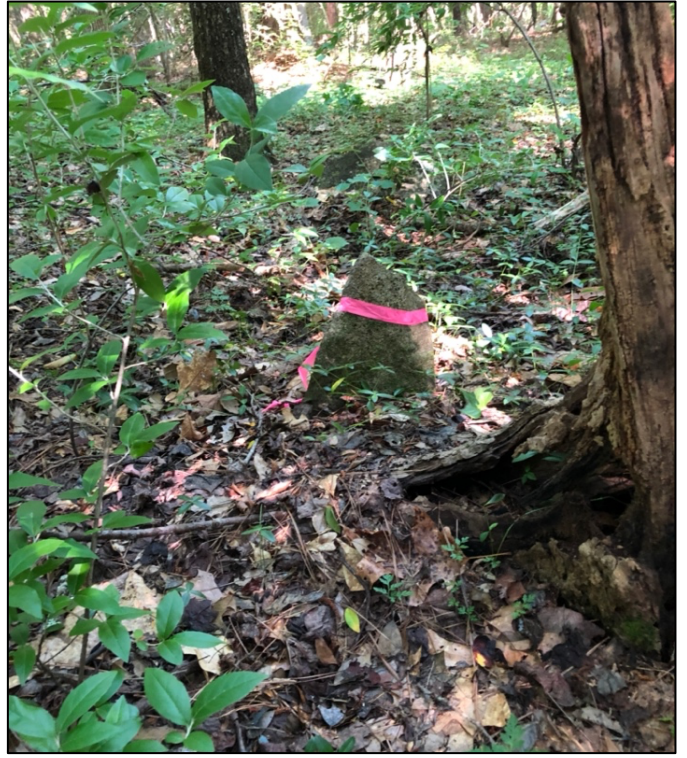
b. Example of a Fieldstone